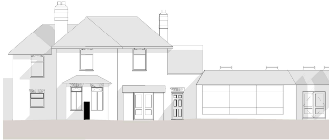
GA Elevation - A - Existing 1:100