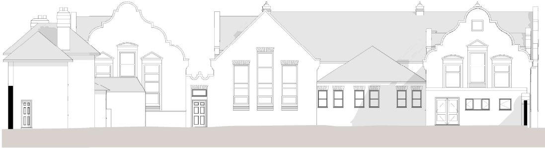
GA Elevation - B - Existing 1:100