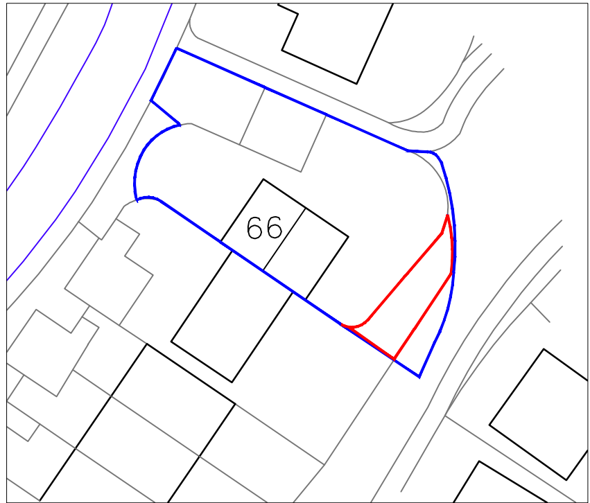
PROPOSED SCALE - 1:500