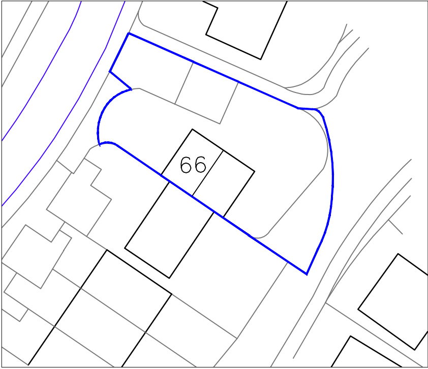
EXISTING SCALE - 1:500