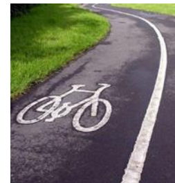
Keep cycle paths free for cyclists