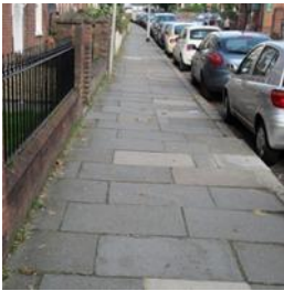
Stay on the pavements and avoid walking on main roads