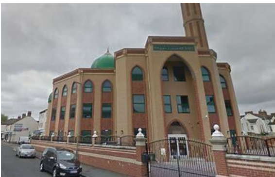
Farooq E Azam Mosque & Islamic Centre, Bowesfield Lane, Stockton-on-Tees, TS18 3B

You may be able to make connections with people of your religious background at the many support networks listed in this pack. Please find some examples of places of worship in Stockton below: