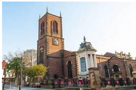
Stockton Parish Church High Street, Stockton-On-Tees, TS18 1SP