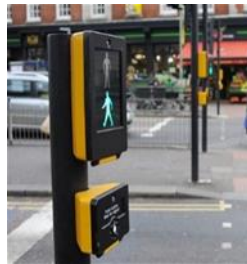
Be safe when crossing roads by using Pelican crossings