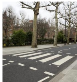
Look both ways when crossing uncontrolled roads