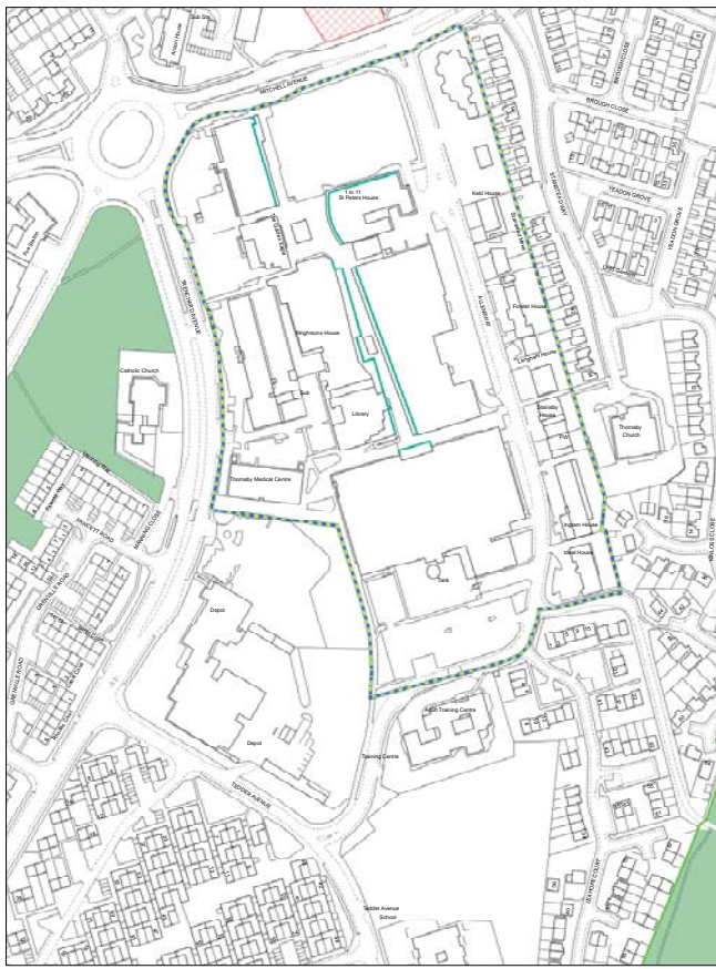
Inset 4: Thornaby District Centre