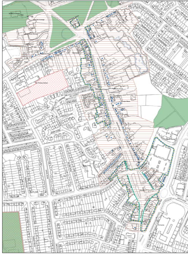
Inset 2: Norton District Centre