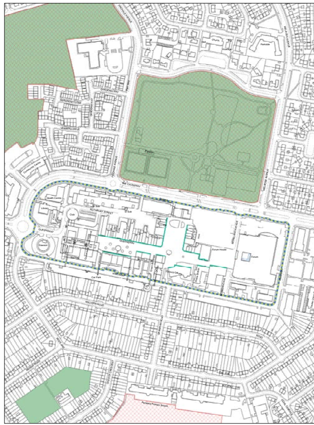
Inset 5: Billingham District Centre