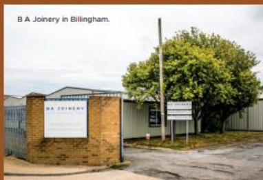
B A Joinery in Billingham.