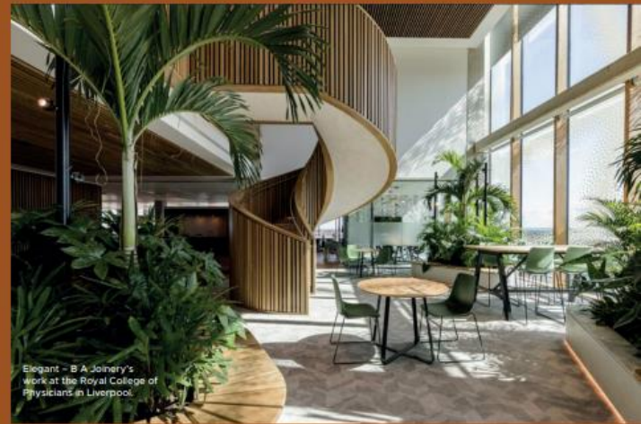
Elegant - B A Joinery's work at the Royal College of Physicians in Liverpool.

"It's a great place to grow your business and you won't be short of support."