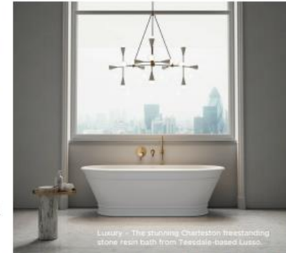
Luxury - The stunning Chatterton freestanding stone resin bath from Teessdale-based Lusso.

The council has a dedicated team to support new and existing businesses that