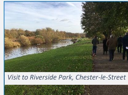
Visit to Riverside Park, Chester-le-Street

The Committee felt that the identified anti-social behaviour problems can be alleviated through further investment in security measures and better management of access points, vehicle controls and greater staff presence. The Committee acknowledged that whilst the improvements may require some initial 'invest to save' funding, there would be savings in ongoing repairs and maintenance which can be offset against these initial, up-front costs. Improvements to the security of the park would also make it a safer environment for park users and prevent further damage.