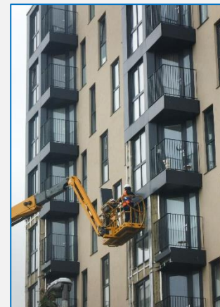
Cladding removal at Kennedy Gardens, Billingham

Recommendations included the lobbying of Government for improved and strengthened building control mechanisms, and for landlords to ensure the maintenance and upkeep of fire risk assessments. The Committee also recommended the installation of sprinkler / misting systems in all high rise residential buildings across Stockton-on-Tees, and called for all key partner agencies to consider the outcomes from the Government's public inquiry into the Grenfell Tower, or any related, fire once available.