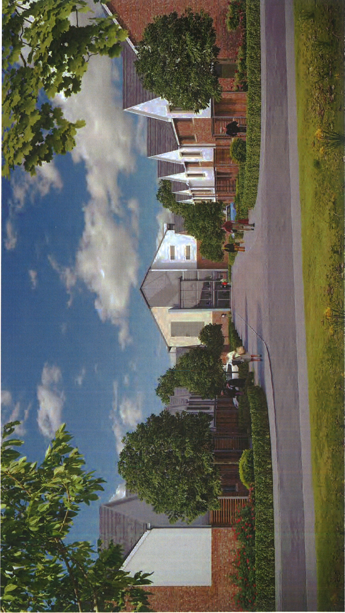
Artists Impression of Extra Care Facility Approach