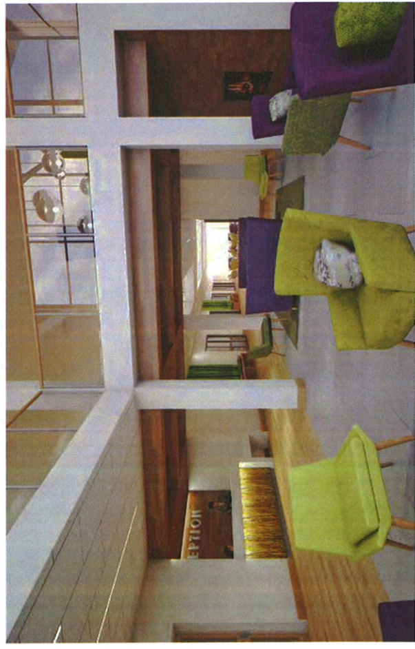
Artists Impression of Atrium Space