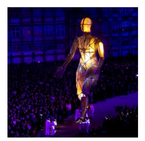
14. Water Fools by llotopie